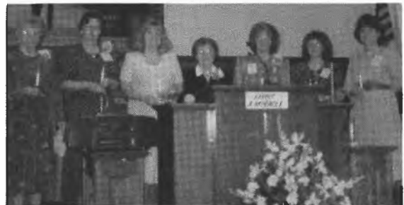
Newly Elected Officers

Congratulations are in order for the ladies at Valley Falls. They did a tremendous job hosting the event. It was evident that a lot of hard work went into planning, preparing, and decorating.