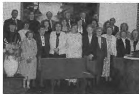
Members of the "66 Bible Club"