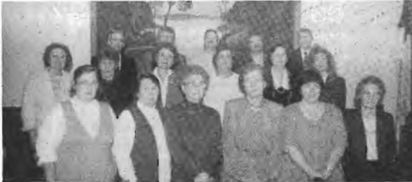
Bible Readers Club Members