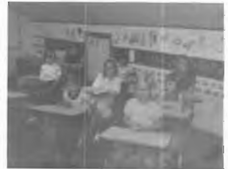
Grades 2-3-4 Classroom