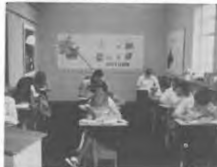
Grades 7-8-9-10 Classroom