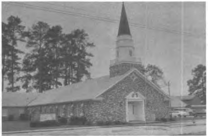
New Prospect FWB Church and School Facilities