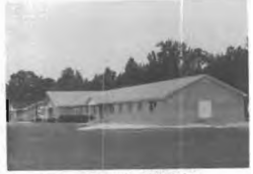
Grace Facilities With New Addition And Parsonage