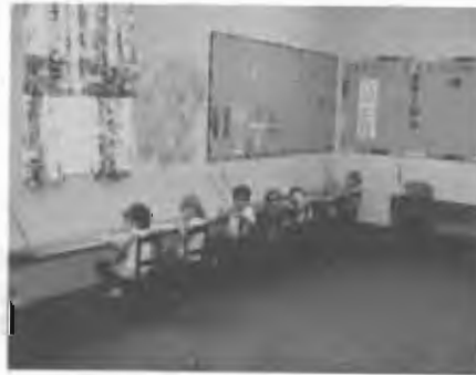
Child Day Care Center