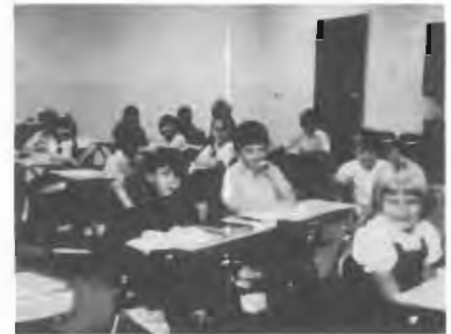
Grades 1 & 2 Classroom