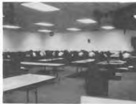
A.C.E. Learning Center