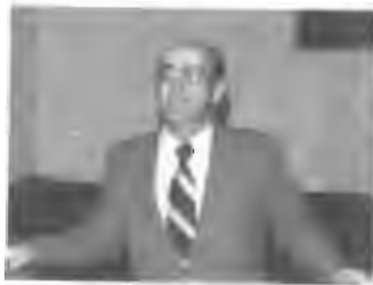
From The Editor

TIME IS FLEETING: Yes! Time is rapidly passing and this year is fast coming to a close. This is the 5th issue of "The Informer" with one more to be published in this year. Shortly after the next issue it will be State Convention time. I am looking forward to this meeting and I hope many of you will begin now to make plans to attend. It's a great time of spiritual refreshing from the preaching, singing and fellowship. An excellent program is in the making, so folks, let's go.