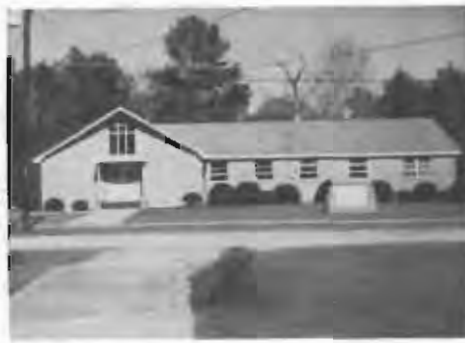
Grace Building Before Addition

Thus, giving with simplicity is giving from an open heart: no secret motive hidden, and no selfish restraint to hinder free response to the needs of others.