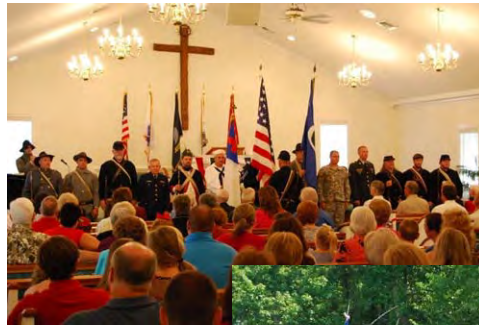
Pictured Right: A 21 gun salute on the church grounds following the meal honors veterans and those currently serving in the military.

was given on the church grounds following the meal to honor veterans and those currently serving in the military.