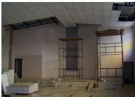
Pictured Left: Inside of the new church and its continual progress church toward completion in Brazil.