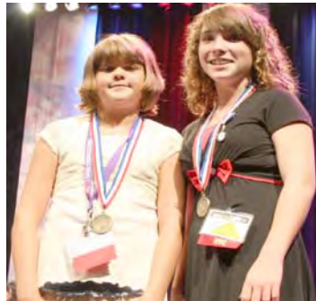
Bay Branch, Timmonsville Dramatic Duo Category B - 1st Place