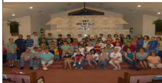
Lighthouse Free Will Baptist Church in Florence got "On Board With Noah" in Vacation Bible