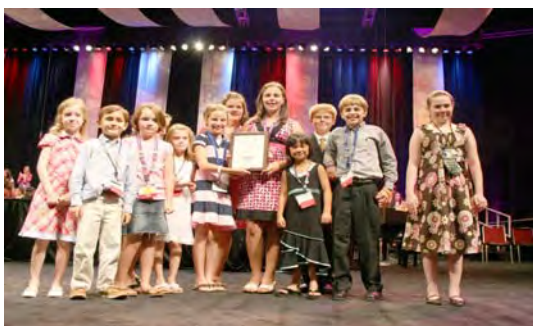
Horse Branch Choir, Turbeville Category B - 1st Place