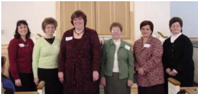
New Officers of the S C District WAC for 2007- 08