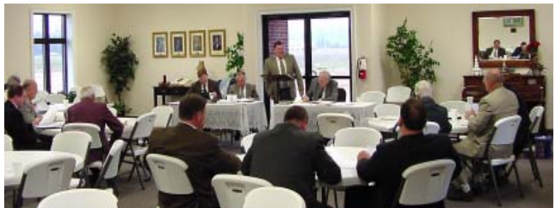
The General Board met to hear and approve reports the day before the State Association was called into session.