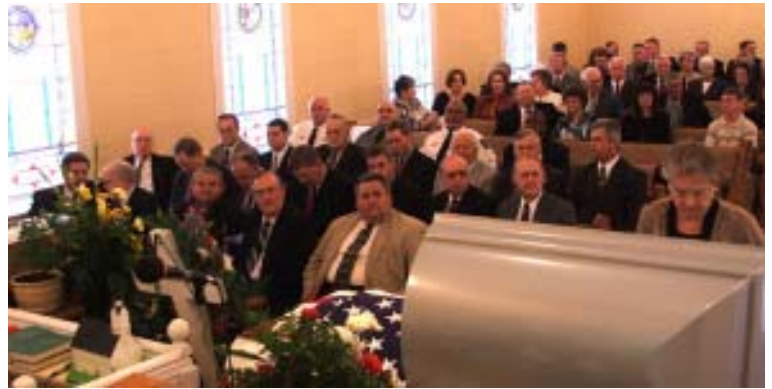
The Honorary Pall Bearer Ministers at the service at Mt. Elon FWB Church, Pamplico.