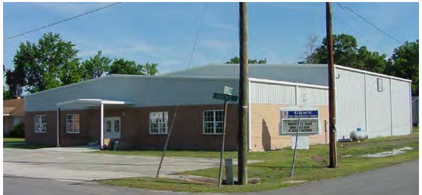
This is the Fellowship Building/Family Life Center recently constructed by Grace FWB Church of Lake City, SC at a cost of around $250,000. The Fellowship Building front part contains a spacious kitchen, elegant rest rooms, and seating for around 200.

The company that supplied our “800” phone number recently went bankrupt. We will wait until a decision is made to secure another. Right now the Book Store can be reached at (843) 662-8682