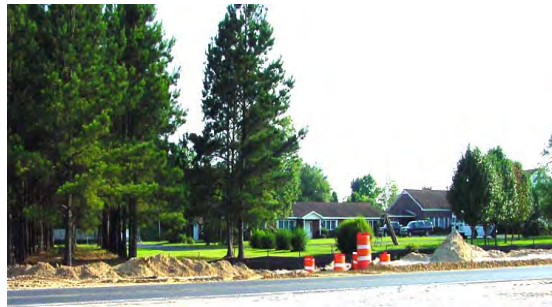
Proposed site of New State Office Complex with Children's Home in the Background

The "Research and Ground Work" committee appointed by the State Association during the 2006 State Meeting has concluded their preliminary work and evaluation of the proposed relocation of the SCFWB State Office and Christian Book Store to property adjacent to the Children's Home and have called for a meeting of the Relocation Committee appointed by the State Association (Basically, the General Board) for Thursday, July 6, 2006 at the SCFWB Children's Home in Turbeville. This will be an open meeting but only committee members will be allowed to make motions or vote.