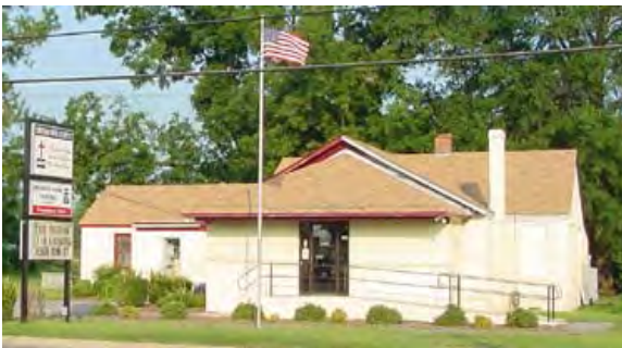
Present State Office and Book Store located at 1705 S. Irby St. in Florence. The State Office is the single room to the left and the Book Store is the main part of the “house”.

In addition to the Primary Relocation Committee recommendation the following have added their support to the concept of relocating the State Office: Children’s Home Board State Executive Committee State Youth Ministries Board State Home Mission Director