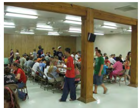
Everyone enjoyed the great meals and the nice facilities this year.