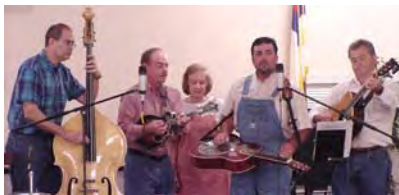
Special Music provided by Crystal River

Calvary FWB Church, Georgetown had a three fold celebration on Sunday, June 12th. They celebrated Home Coming, Old Fashion Day, and Building Dedication for their remodeled Church all on the same day. Many people wore "old fashion" clothes, milk pails were used to receive the offering, the communion table flowers were in a tin tub, and pictures of past services were on display.