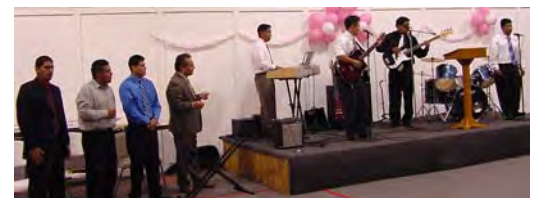
Hispanic Pastors and Musicians

The Roca de Salvacion Church meets each Sunday afternoon at 3pm and each Thursday night in the sanctuary of Lebanon FWB Church.