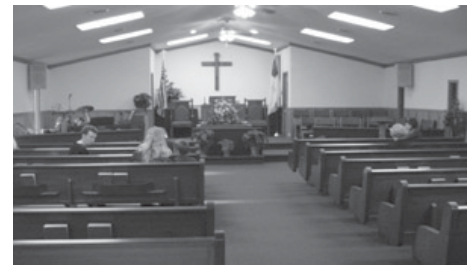
The newly remodeled sanctuary of Heartland FWB Church

A long hard week of work, that did not end until very late Saturday night, brought a big smile to the faces of the members of Heartland FWB Church, Lancaster when they arrived on Sunday, December 5th. New carpet was installed, the pulpit area was remodeled with new altars installed, and a new baptismal pool was installed and ready for use.