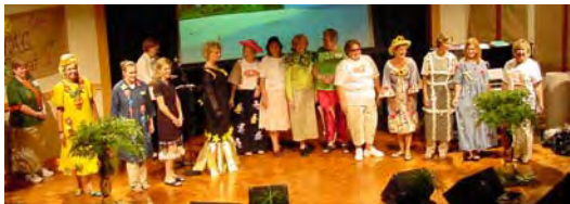
The Friday Night Palmetto Fashion show was enjoyed by all.

2005 SCWAC Fall Prayer Retreat. The 2005 South Carolina Free Will Baptist Women Active for Christ Fall Prayer Retreat was held at White Oak Conference Center in Winnsboro, SC. Our theme this year was "Palm Trees" and our Bible verse was Psalm 92:12- "The righteous shall flourish like the palm tree: he shall grow like a cedar in Lebanon." This was especially touching as we all learned that everything on the palm tree is used with nothing being wasted. We, as Christians, need to live our lives for Christ with nothing wasted. The palm tree's roots run deep to withstand any storm. We, too, should strive to be like the palm tree with our roots deep in Christ's Word so we can withstand the storms in our lives.