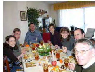
The Spain Missionaries share Thanksgiving Dinner together.

More than anything, we want to share with him a special package. We want him (and many others in Alpedrete) to know the joy and peace that come from knowing Jesus as a true person, not just a small part of the nativity scene each Christmas. No package could be worth more to the people of Alpedrete than the one that came wrapped in swaddling clothes over two thousand years ago. Help us pray that this Christmas season will give us many opportunities to share this precious gift with them. (Their Mailing address is- C/Alpes, 26 28430 Alpedrete (Madrid) SPAIN)