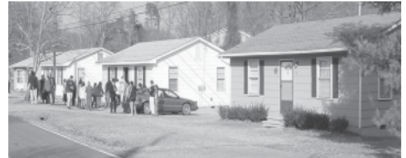
Hispanic Institute Dorm Homes across the street from the First FWB Church, Inman.

The services concluded as everyone toured the dorm homes provided by the First FWB Church of Inman. These home are beautifully decorated and furnished with the appliances needed by the students. In order to furnish these home the Home Mission department borrowed $19,000 counting on the fact that the South Carolina Women Active for Christ have a project this year of raising the needed money for this important ministry.