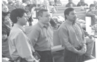
The First 3 Students

Services began in the Fellowship Building with a delicious “Fiesta” of traditional Mexican food prepared by the members of the Community Hispanic FWB Church of Una. Then everyone adjourned to the church sanctuary for the dedication service. All of the Pastors and their wives were recognized as well as the members of their church who attended. A letter was read from Governor Mark Sanford expressing appreciation for the Hispanic Institute and other local government officials were recognized.