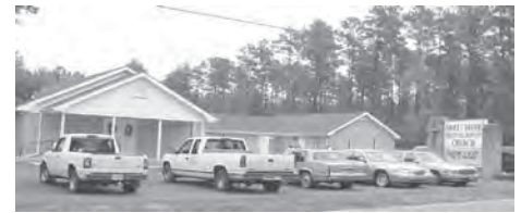
Sweet Home FWB Church