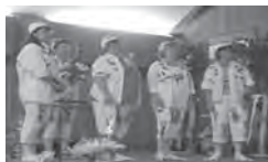
These “Birds” flew in from Low Country FWB Church

The Ladies have done it again! Around 225 ladies gathered at Look-up Lodge on Friday, September 5th for their annual WAC Retreat. Friday night was a time of fun and fellowship as ladies came dressed in Bird attire to go with this year’s theme of “Believers In Christ Rejoicing Daily”. Games, songs, and a time to “Rock the Robin” showed