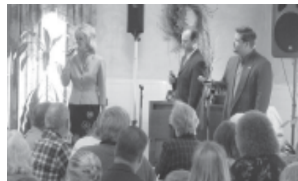
"8th Day" praise the Lord in Song before the Message.

A delicious meal followed as everyone rejoiced in God's continued blessings on this vital ministry in our state.