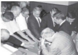
A sacred time as a Minster is set apart for God’s Work.