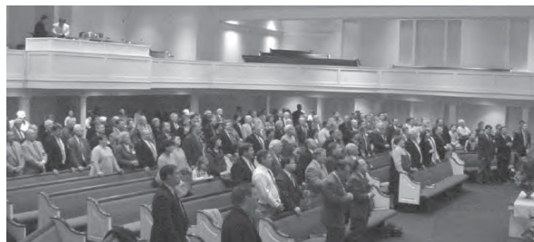
Ministers and Delegates enjoy the new Sanctuary at Peace FWB Church, Florence, SC.