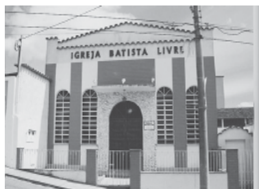
First FWB Church of Barbacena

Pray for and support our Team in Brazil. They carry a big burden (Church planting, Seminary Training, Children's Home Ministry, Youth Camp Ministry, etc) and they have a great opportunity to reach the great people of Brazil.