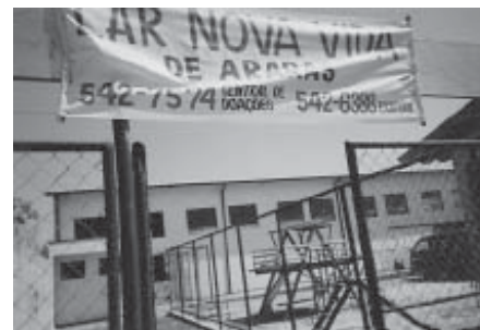
The New Life Children's Home in Araras that a group from South Carolina went to Brazil to work on in 2001