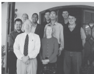
Students and Staff of the Barbacena Bible Institute after the Executive Secretary had taught a class