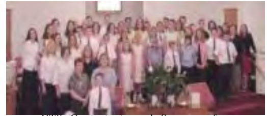
CTS Contestants and Sponsors from the Lower State District

Florence Ensemble 2.6 Large Ensemble Florence First