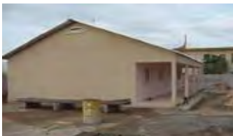
The Finished Parsonage