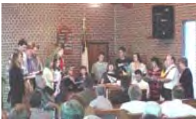
New Prospect Youth sing during Revival at Unity FWB Church