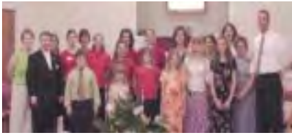
CTS Contestants and Sponsors from the Upstate District