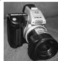
Temple FWB Church gave the State Promotional Office the funds for a new Digital Camera. GLORY!