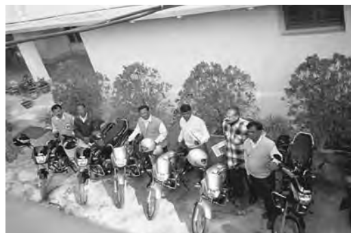
Proud Pastors in India show off the new Motor Bikes purchased by South Carolina Churches