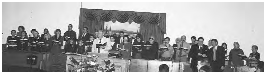
The Mass Choir of First FWB Church, Chester helped make Carolina Camp Meeting another Great success this year.

ROLL CALL SUNDAY- EASTER SUNDAY, MARCH 31, 2002. Make your Plans for your biggest day ever!