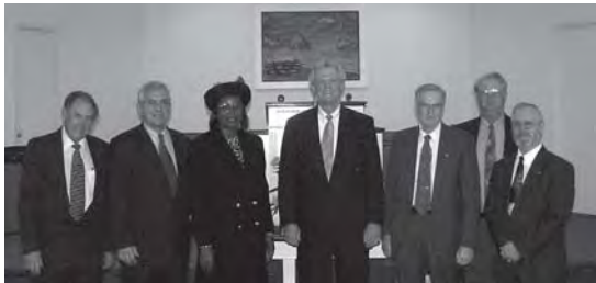
The Deed to 1.08 acres of land is presented to the Trustees and Pastors of Immanuel by officers from Lakeland Investors

Be heard, cry out, and mount an assault on the evil being taught to our children. Flood the schools with gospel tracts that clearly show God's teaching against this wicked sin. Students cannot be forbidden to give out tracts to fellow students. Let's be heard. We have God's message. Let's suffer for Christ's sake. To God be the glory!!! AMEN!!!