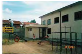
A trash heap has become a Playground!

Circumstances prevented the Second Chance Team from completing the work on the building for the Comb's Children's Home in Brazil during their visit in May but God prevailed and the building is now complete and in use. Here are a few pictures of what God had marvelously done.