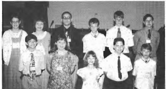
"God's Little Singers and God's Little Ringers"