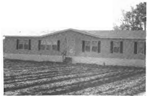
2434 Allen Road. Home of the Promotional Director and His Princess .

My wife and I love where we live; but, as you can see, our mobile home sits in the middle of a plowed field. One rainy Saturday we returned home