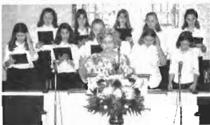
The Youth Choir of Black River F.W.B. Church provided special music.